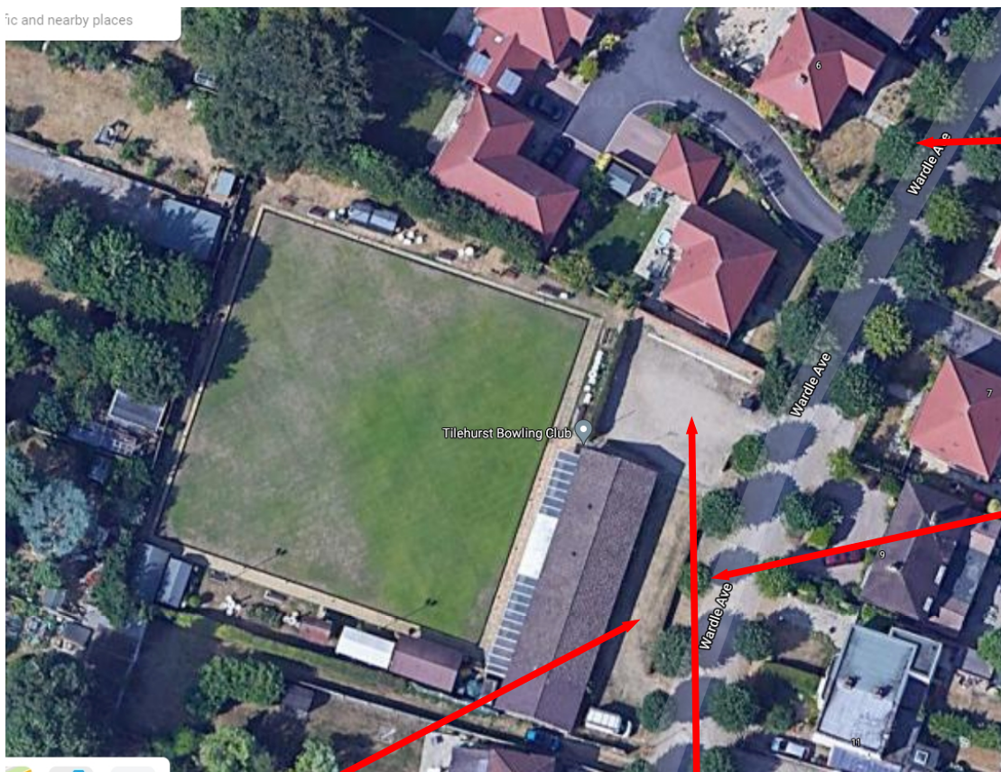
Tilehurst and nearby places

There are spaces for 4 cars parked nose-in in front of number 6, Wardle Avenue.